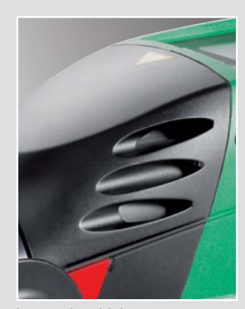
Low-noise, high power transmission

We have many further welding shoes in our program. Enquire from us!