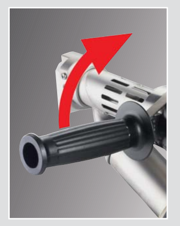
Freely adjustable swivel-mounted handgrip