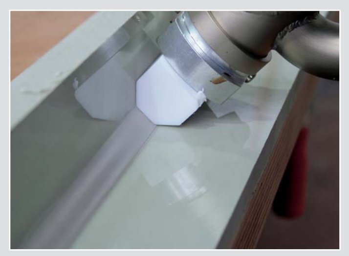
Perfect welding seams succeed with the WELDPLAST S2.

WELDPLAST S2, 230 V, with Euro plug 127.215