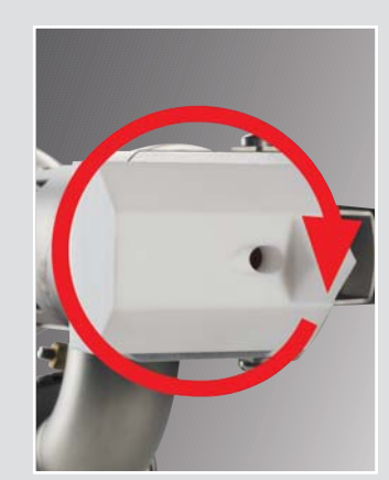
360° rotating welding shoe